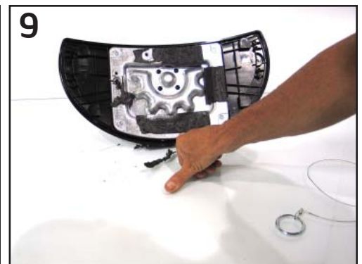
Repeat same process to remove foam / adhesive from TV base.