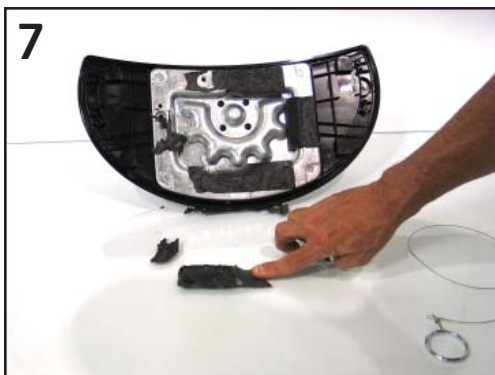
Using your finger, rub firmly to remove any foam / adhesive residue.