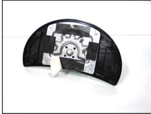
AMP01 Adhesive Mounting pad as installed to TV base.