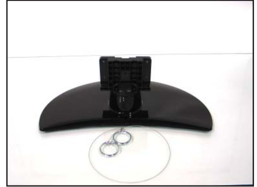
TV base as adhered to surface media. Glass surface as shown.