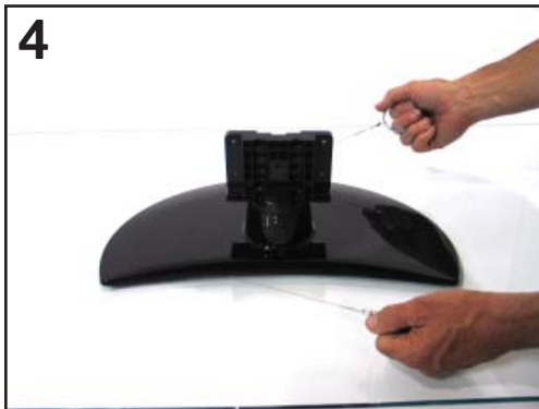
Place fingers in rings. Slide cutting cable between surface of table top and TV base. Create tension on the cutting cable.