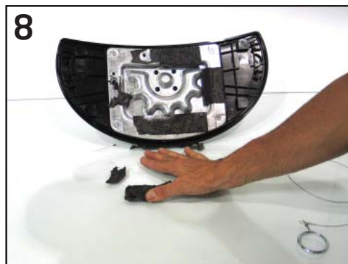
This process should only take a few minutes in many instances no removal chemicals will be required