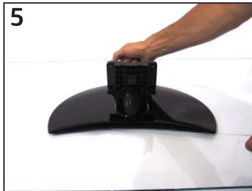
Using a sawing motion with cutting cable pulled tightly. Saw back and forth, you will begin cutting thru the Adhesive Pad in seconds.